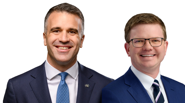
Chris Picton MP Shadow Health Minister